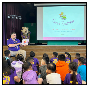
An Always Dream Classroom